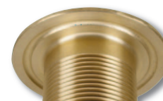
Illustration Of Bedding Groove

Spare Flanged Nut See Fig. 0075, on page 105.