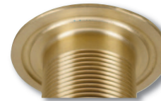
Illustration Of Bedding Groove

Spare Flanged Nut See Fig. 0075, on page 105.