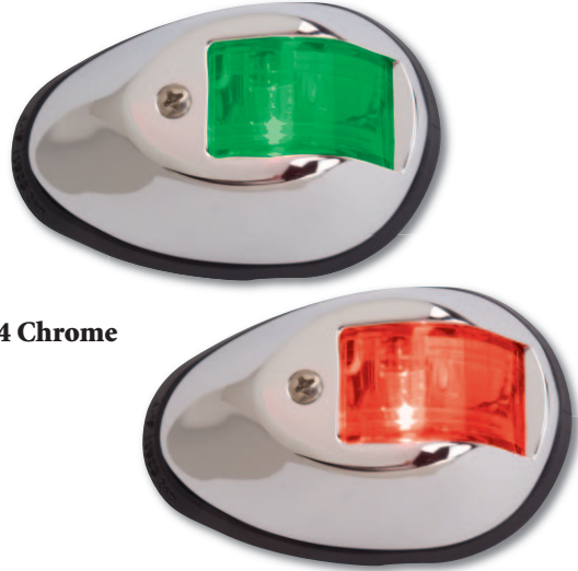
Fig. 0254 Chrome