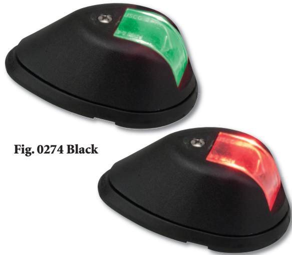
Fig. 0274 Black