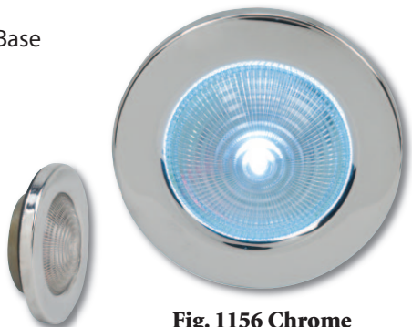
Fig. 1156 Chrome