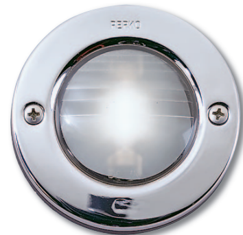
Fig. 1146 Chrome